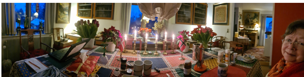
Our dining room.

I read the newspapers every morning, before and after breakfast: Berlingske [B] and Kristeligt Dagblad [KD]. Fridays also Weekend Avisen . KD is, in my mind, the best. Many of the books I buy stems from references in KD. Once a month the morning post also brings me Tidehverv 2 , a debate monthly. I devour most of its essays that and the next few days!