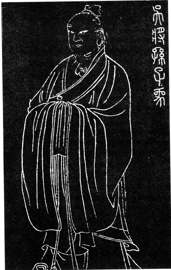
Portrait of Sun Wu 孙武画像