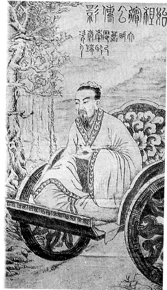
Portrait of Sun Bin 孙臏画像