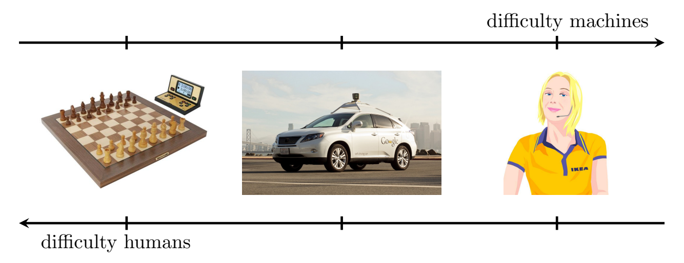
Figure 1: For many types of tasks, the axis of difficulty for machines is opposite the one for humans.

Modern computers are however much more easily overwhelmed by problems in which the rules or the goal – or both – are less clearly formulated and delimited. One such example is driverless cars. As in chess, there are also rules to obey in traffic, but there are many more rules than in chess, and they are much less formally specifiable. It is even more complicated for computers to successfully small talk with a human for a few minutes over a cup of coffee. Chatbots are computer systems for engaging in dialogue with humans, and the dialogue can either be in writing or through a voice interface. Building a chatbot that can engage successfully in small talk with humans is exceptionally difficult, as the rules of such dialogues are even much less clear than the rules in traffic. This is also why a lot of the chatbot technology that